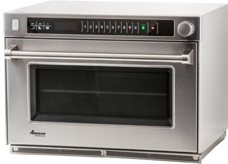
Model AMSO22 shown